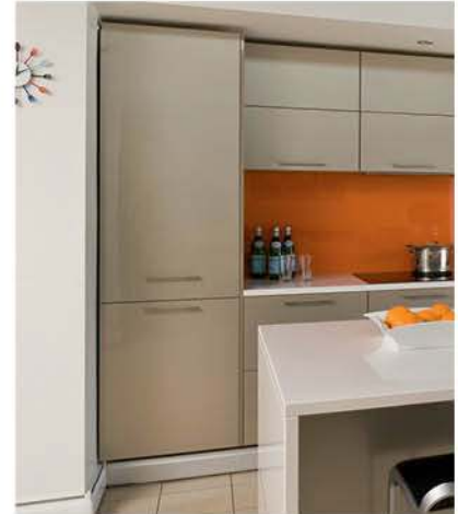
Above The integrated Miele fridge and freezer sit within the kitchen units

'The island: I love it when people come to sit and chat with me over a glass of wine while I cook. I don't miss out on anything anymore.' 🏠